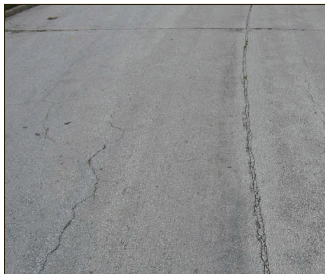
Figure 10. Medium ratings of joint reflection cracking, cracks that mirror joints, are those with cracks \frac{1}{4} to \frac{3}{4} inch wide.

Transverse cracks run perpendicular to the direction of the road. These cracks typically start at the top and move towards the bottom.