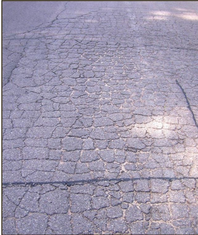
Figure 8. High alligator cracking is a network of cracks that have formed and grown into blocks. Areas where dense cracks have formed pump when loaded.