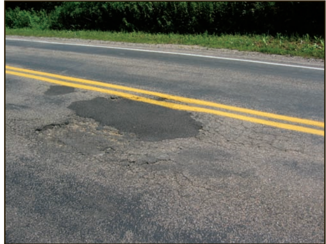
Figure 16. Medium ratings of patching are areas moderately deteriorated that had been replaced with new material.

Smooth appearance of the pavement. When touched, there is little to no friction on the surface of the pavement (figure 18).