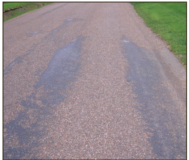
Figure 25. High severity raveling of a seal coat.