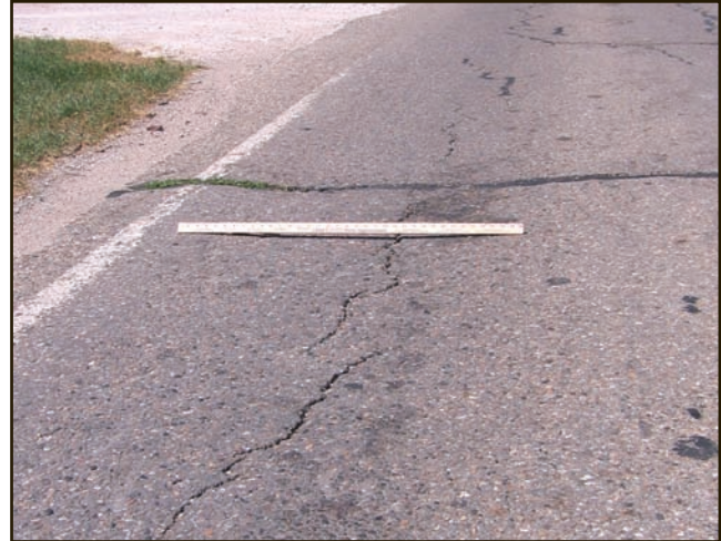
Figure 21. Longitudinal cracks at the bottom of rutting are often caused by structural failure of the subbase.

Medium —Causes moderate problems with ride quality.