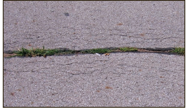
Figure 24. Low level spalling where parallel satellite cracks are beginning to form.

High —Aggregate or binder has worn away considerably. Surface is very rough and severely pitted.