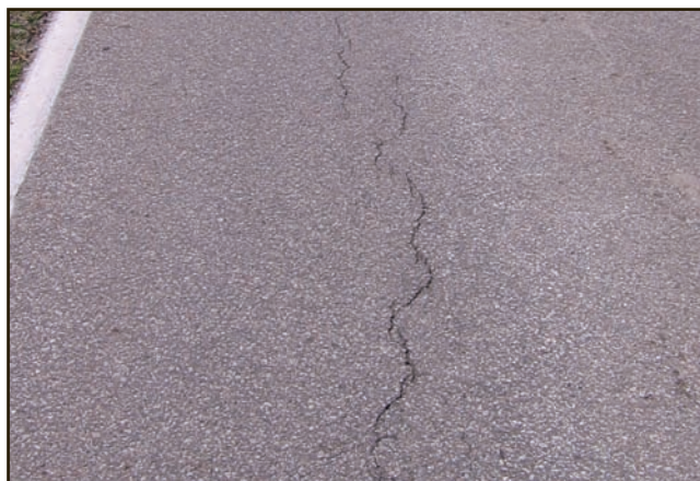
Figure 12. Medium ratings of longitudinal cracking, cracks that parallel the direction of traffic, are those with cracks \frac{1}{4} to \frac{3}{4} inch wide.