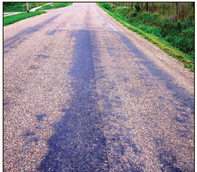
Figure 26. New raveling of a pavement surface.