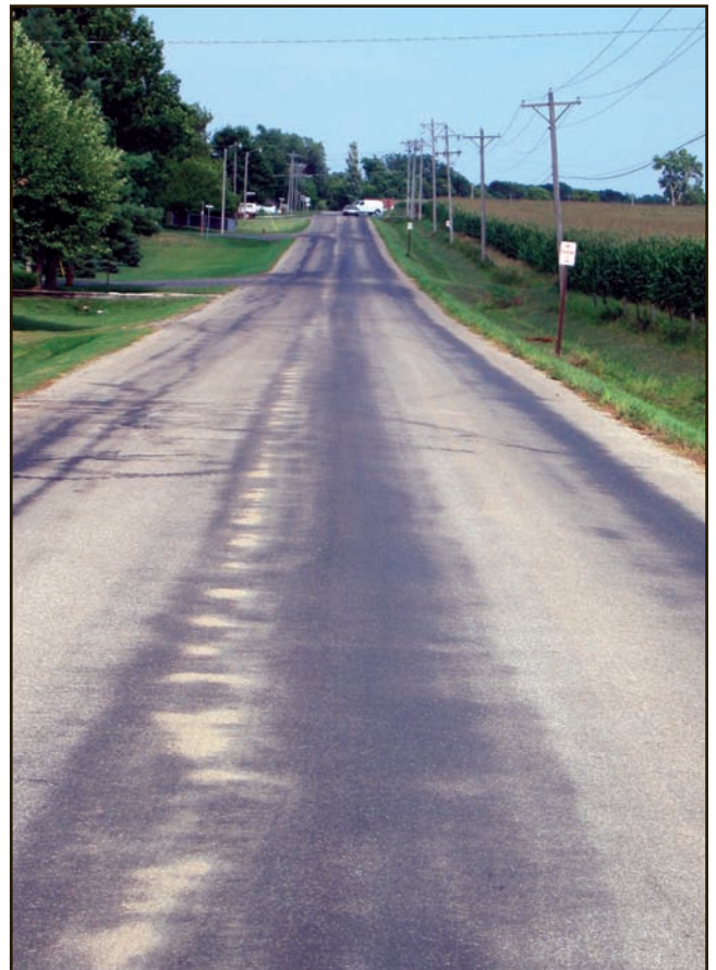
Figure 5. Low levels of bleeding are often the result of too much asphalt binder being pushed to the surface, but aggregate is still exposed, and asphalt does not stick.

High —Bleeding has occurred to the extent that asphalt sticks to shoes. Shoe soles and tire treads are left in the surface. Aggregate is barely visible (figure 6).