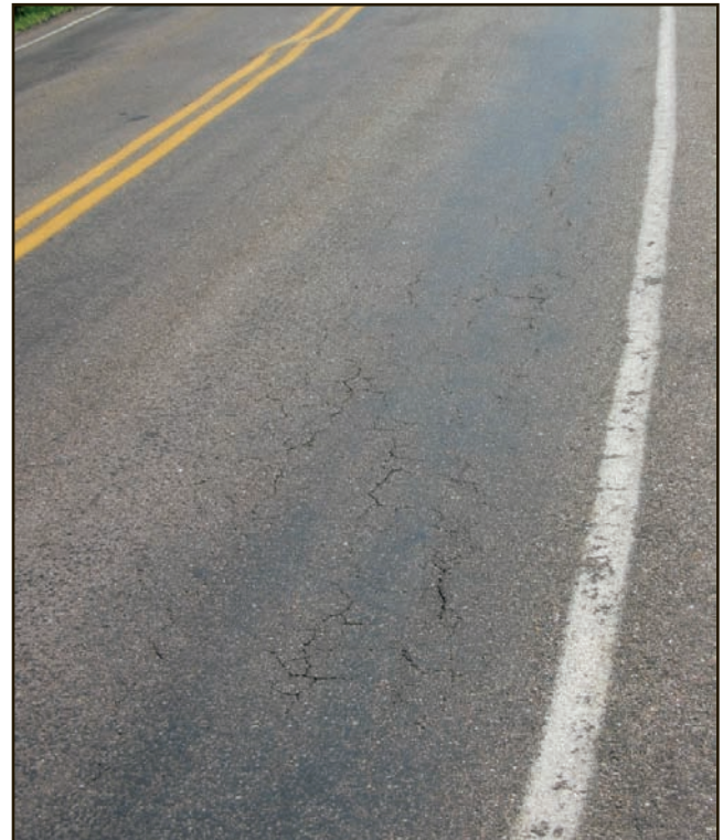
Figure 7. Low levels of alligator cracking begin with a few hairline longitudinal cracks, but pavement do not pump under loading.

Block cracking is caused by the shrinkage of the pavement due to daily temperature cycling. It most commonly appears in desert climates where there are wide differences between daytime and nighttime temperatures.