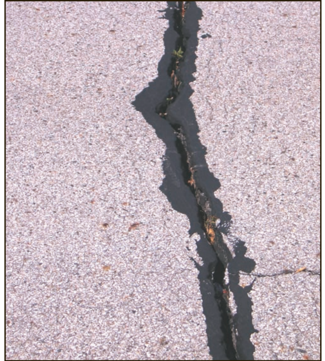
Figure 14. High severity ratings of transverse cracking are wider than \frac{3}{4} inch wide and are spalling.