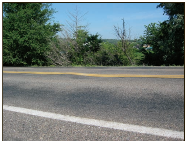
Figure 23. Shoving or corrugation of pavement surface is a longitudinal wave or bump in the asphalt, usually on hills, curves, or intersections.