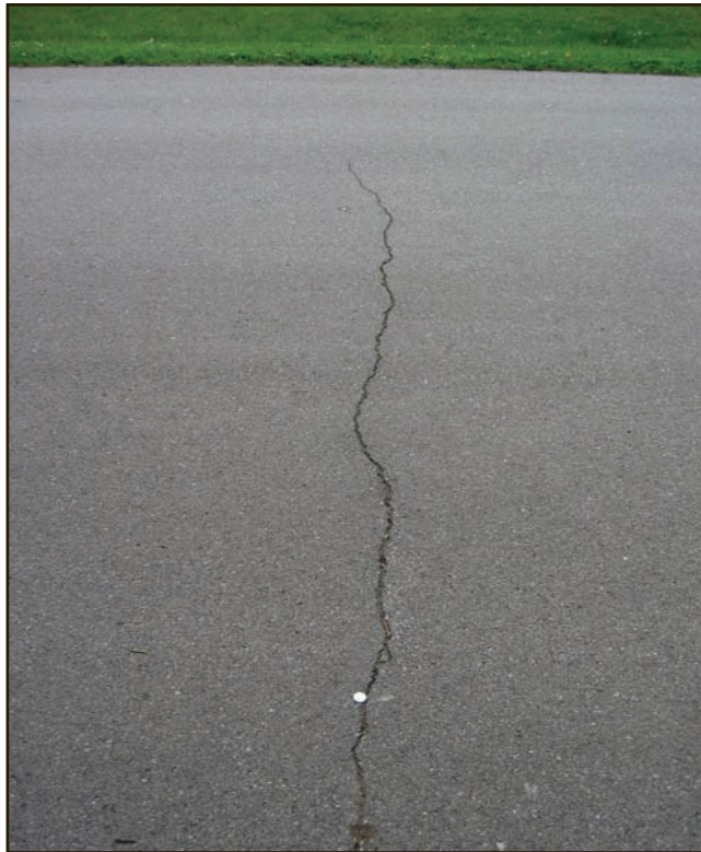
Figure 13. Medium ratings of transverse cracking, cracks that run perpendicular to the direction of the road, are those with cracks \frac{1}{4} to \frac{3}{4} inch wide.

Surface of the pavement is a light gray. Surface binder is brittle. Aggregate can be easily removed from the surface (figure 15).