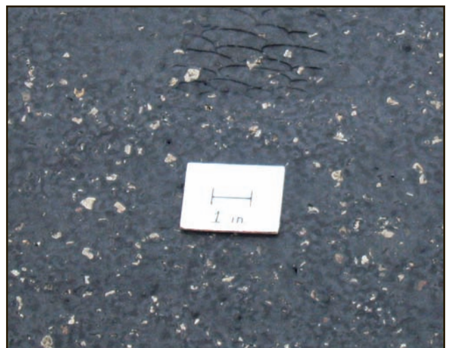
Figure 6. In high ratings of bleeding on pavements, shoes and tires stick to the surface and aggregate is barely visible.