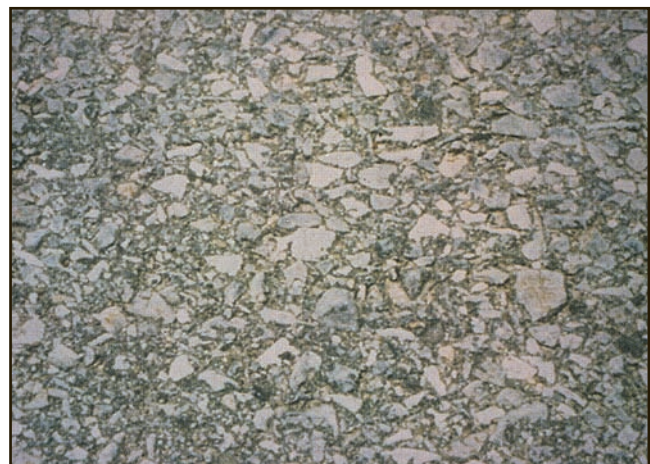
Figure 18. Polished aggregate is smooth pavement with little or no friction. (FHWA)