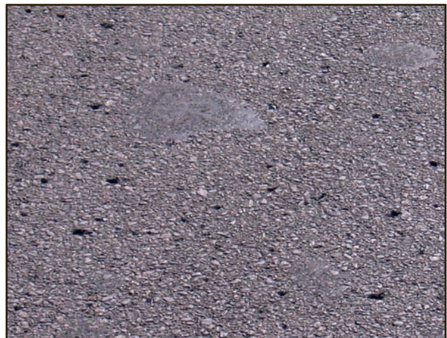
Figure 17. Pocking occurs when pieces of aggregate become dislodge or deteriorate prematurely.