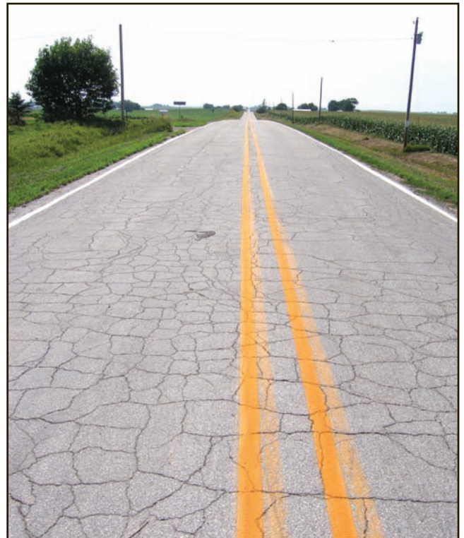
Figure 9. High block cracking ratings are those with cracks wider than 3/4 inch that are spalling. They occur over in large rectangles over the entire pavement.

When the joints in the underlying layers move, the surface layer moves and reflects the joint cracks. Movement of the underlying pavement may be vertical, caused by traffic, or horizontal, caused by shrinkage.