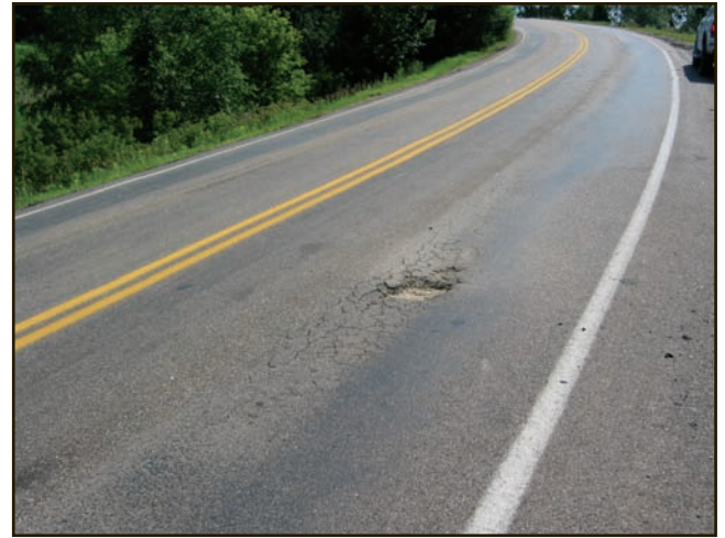
Figure 19. Potholes are a bowl-shaped hole in the pavement surface generally surrounded by alligator cracking.

There are three possible causes. (1) If the pavement has risen around the edges of the rut, the rut is most likely caused by an unstable mix that flows out from under the wheel and moves to the edges. (2) If there are longitudinal cracks at the bottom of the rut, it is most likely caused by structural failure