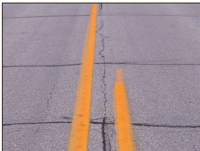
Figure 11. Longitudinal cracking can occur down the centerline where construction joints intersect, parallel to the direction of traffic.