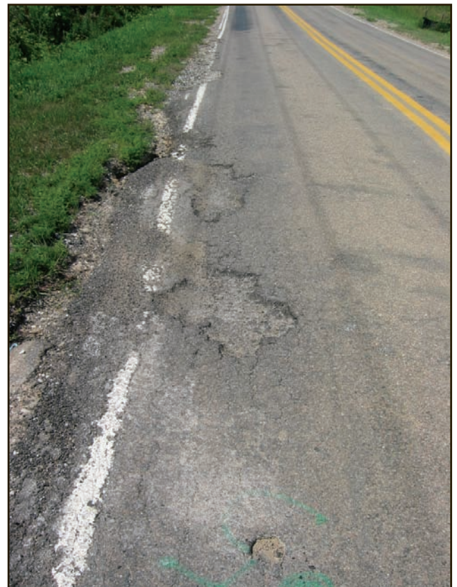
Figure 20. High severity rated potholes are 1–2+ inches deep and range from 18–30 inches in diameter.