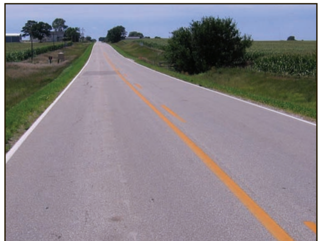
Figure 15. Oxidation of pavement is caused by exposure to the sun and to water, causing binder to become brittle.